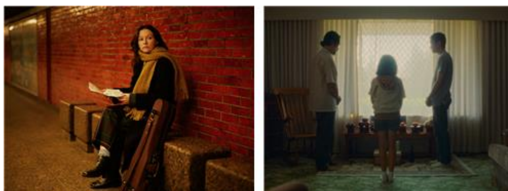
▲ From the left: Measures for a Funeral , Mongrels