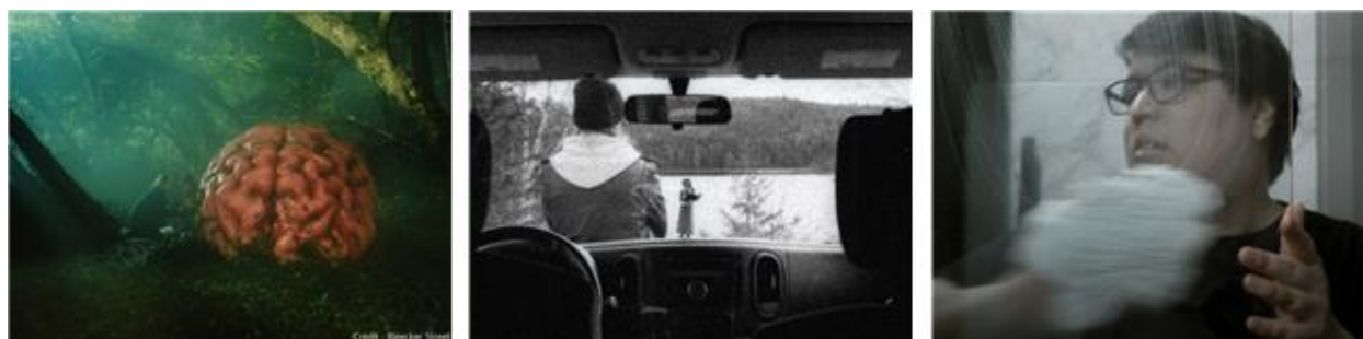
▲ From the left: Rumours , Days Before the Death of Nicky , Paul

The lineup includes a diverse selection of Canadian films, ranging from the latest works by renowned directors such as Guy Maddin and Denis Côté to those by emerging talents.