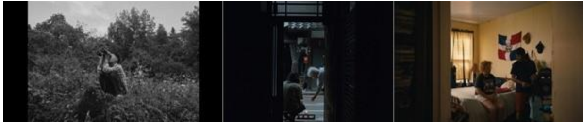
▲ From the left: Always , Ulysses , Mad Bills to Pay (or Destiny, dile que no soy malo)